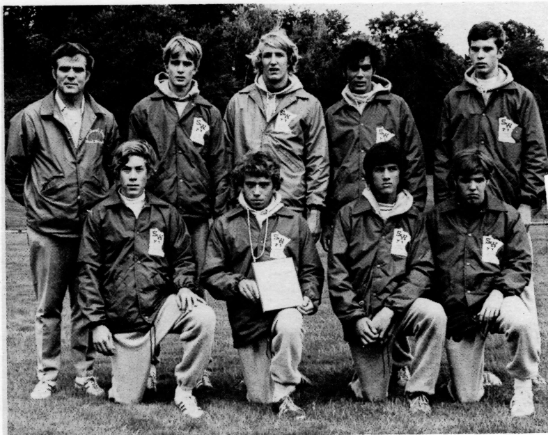
1972 TEAM CHAMPIONS